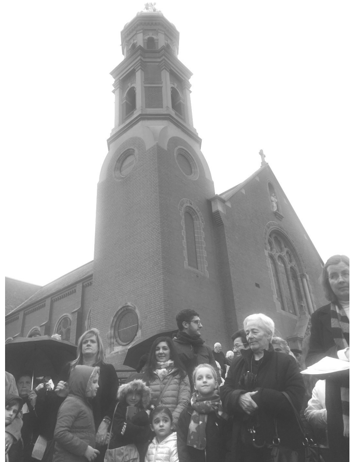
Parishioners gather outside Our Lady's church before Mass for the Acknowledgment to Country

Over the last one hundred years issues have changed, but church communities still gather and pray about the needs and suffering of people in the wider community. Since World War II, Our Lady's has welcomed many migrants from Italy, and from other parts of Europe and Asia.